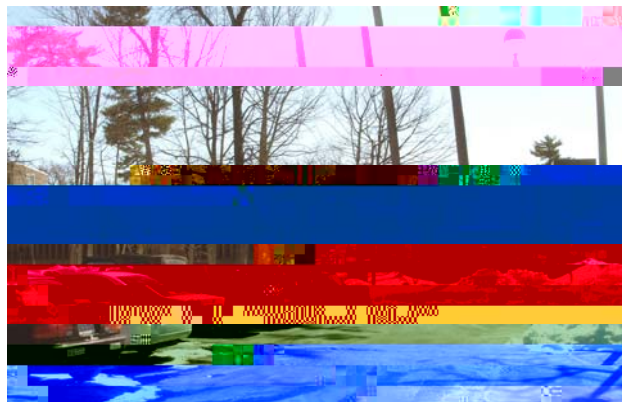
Dana/ Palamountain Entrance

Site lighting performs both a safety function as well as an opportunity to support and highlight the issues noted above. A continuation of the current standards should extend into the new areas and opportunities should be identified for lighting to reinforce the points of entry and gathering at primary locations around campus.